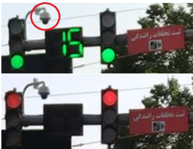
Fig. 2: Traffic control camera position and signal countdown timer operation under scenario 4